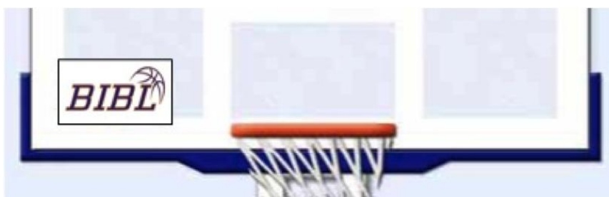
Diagram – Backboard BIBL logo

7.2.11. BIBL Ltd. assigns to all participating clubs the rights of advertising on the official game uniforms of the players.